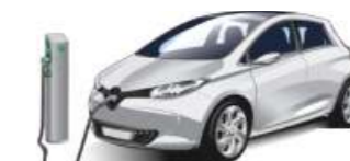
AUTO ELECTRICAL & ELECTRIC VEHICLES