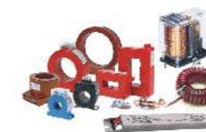
ELECTRONICS & LIGHTING